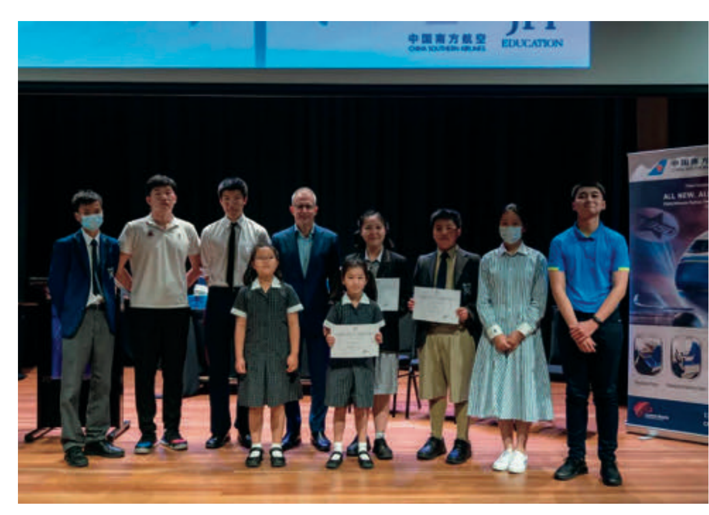
2021 Celebration of Learning Award Ceremony Presented by The Hon. Paul Fletcher ( Minister for the Arts )