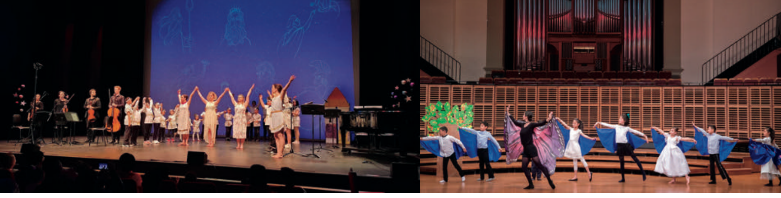
2019 The Planetarium Concourse Theatre