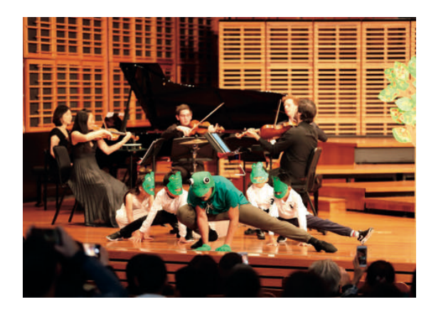
2018 La Boîte à Joujoux (Toybox) Verbrugghen Hall Sydney Conservatorium of Music

YAE connects across cultures by bringing together students and teachers from around the world, with a mission to foster global citizenship through the arts.