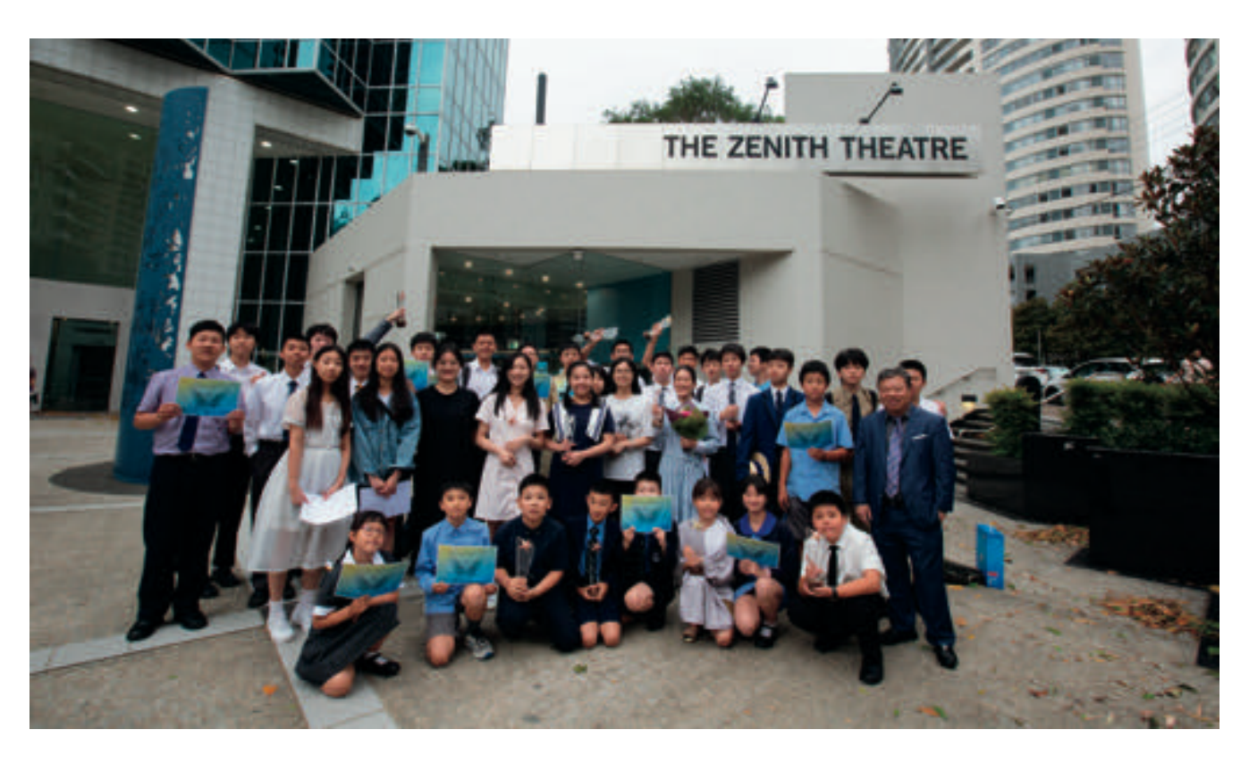
2020 Australian Youth Speech and Debate Competition