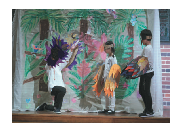
2022 Voices of Feathered Friends Mosman Art Gallery