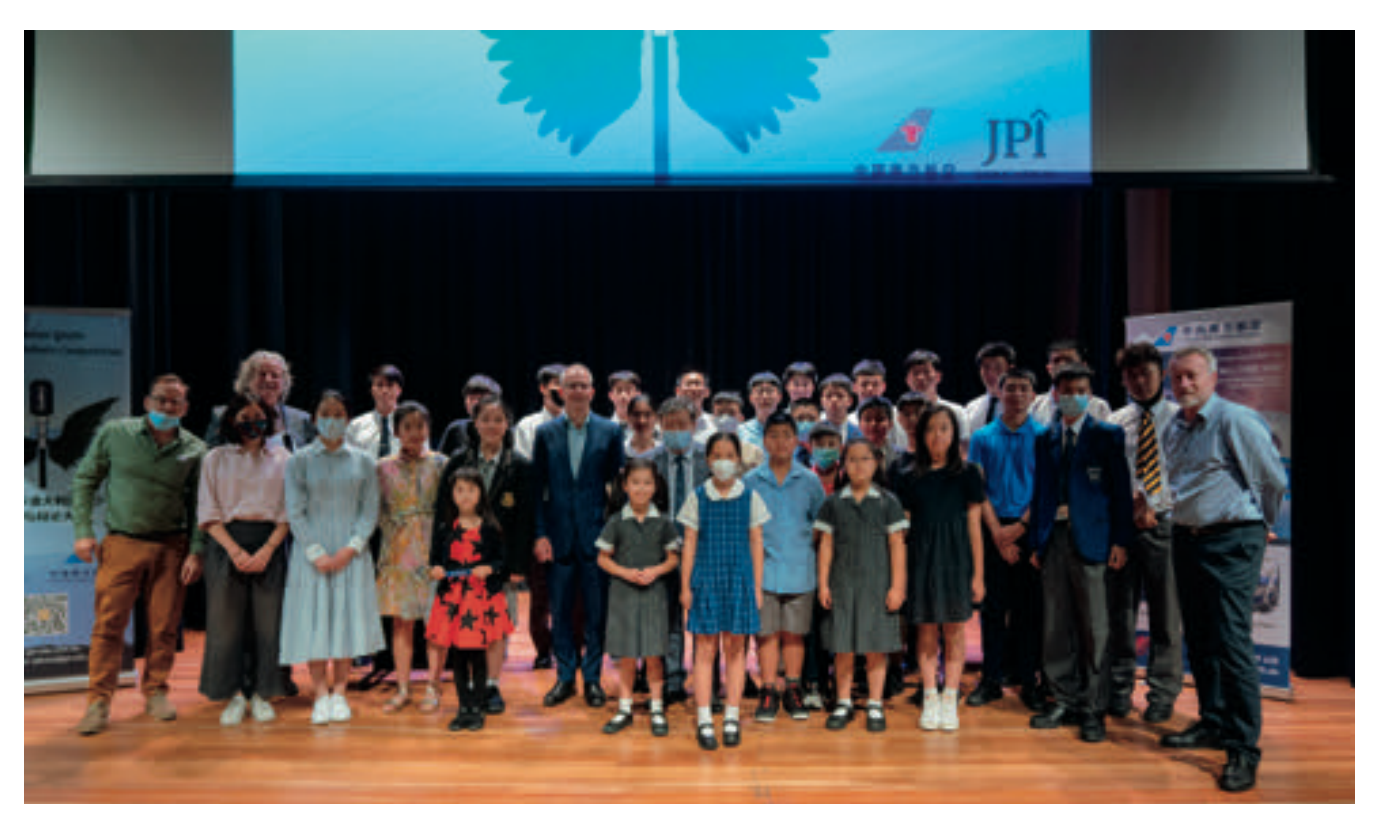
2021 Australian Youth Speech and Debate Competition